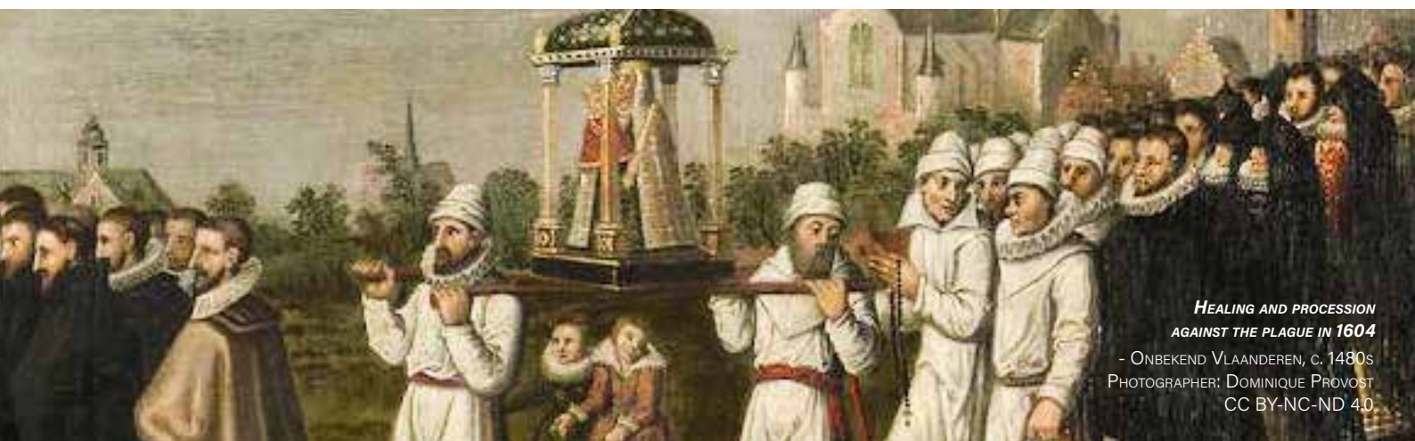
HEALING AND PROCESSION AGAINST THE PLAGUE IN 1604

Processions give testimony to the joy and beauty of the Christian life. They have a wonderful evangelising influence on both those who are active and involved in the procession as well as those who witness them. They are a way of giving praise and also allowing the wider community to witness a beautiful, creative and joyful demonstration of Catholic life. Many parishes and ethnic groups in Sydney already hold processions on the feast day of their parish's patron, or some other saint who is significant to the community. They can also be held on a significant Marian feast such as Our Lady Help of Christians who is the patroness of Australia, or another significant solemnity such as on the feast of Corpus Christi, Christ the King or Palm Sunday.