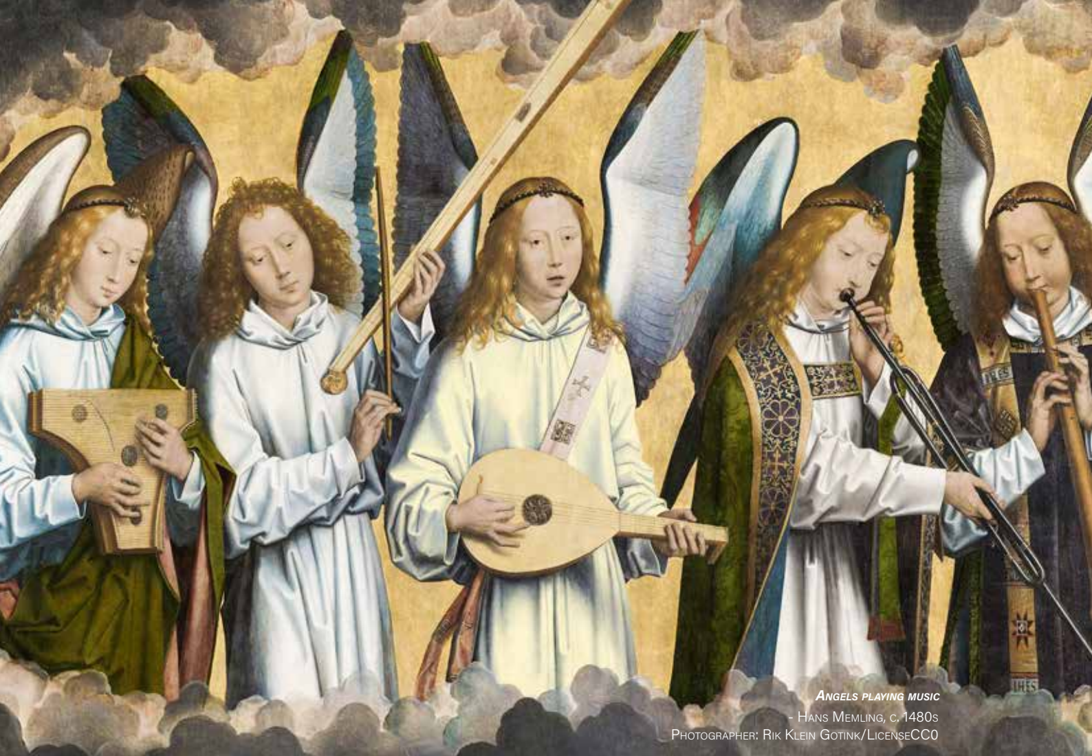
ANGELS PLAYING MUSIC